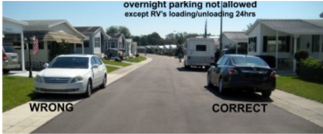
Please do not park on sidewalks or grass

6002 Presidential Circle 5945 Benz Drive 740 Viau Way 6045 Presidential Circle 6313 Jessup Drive 6444 Presidential Circle 6240 Jessup Drive 5935 Utopia Drive