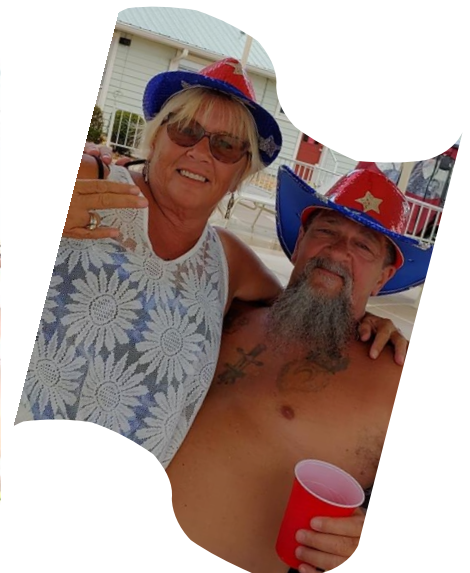
Some Fun Pics from July 4, 2020