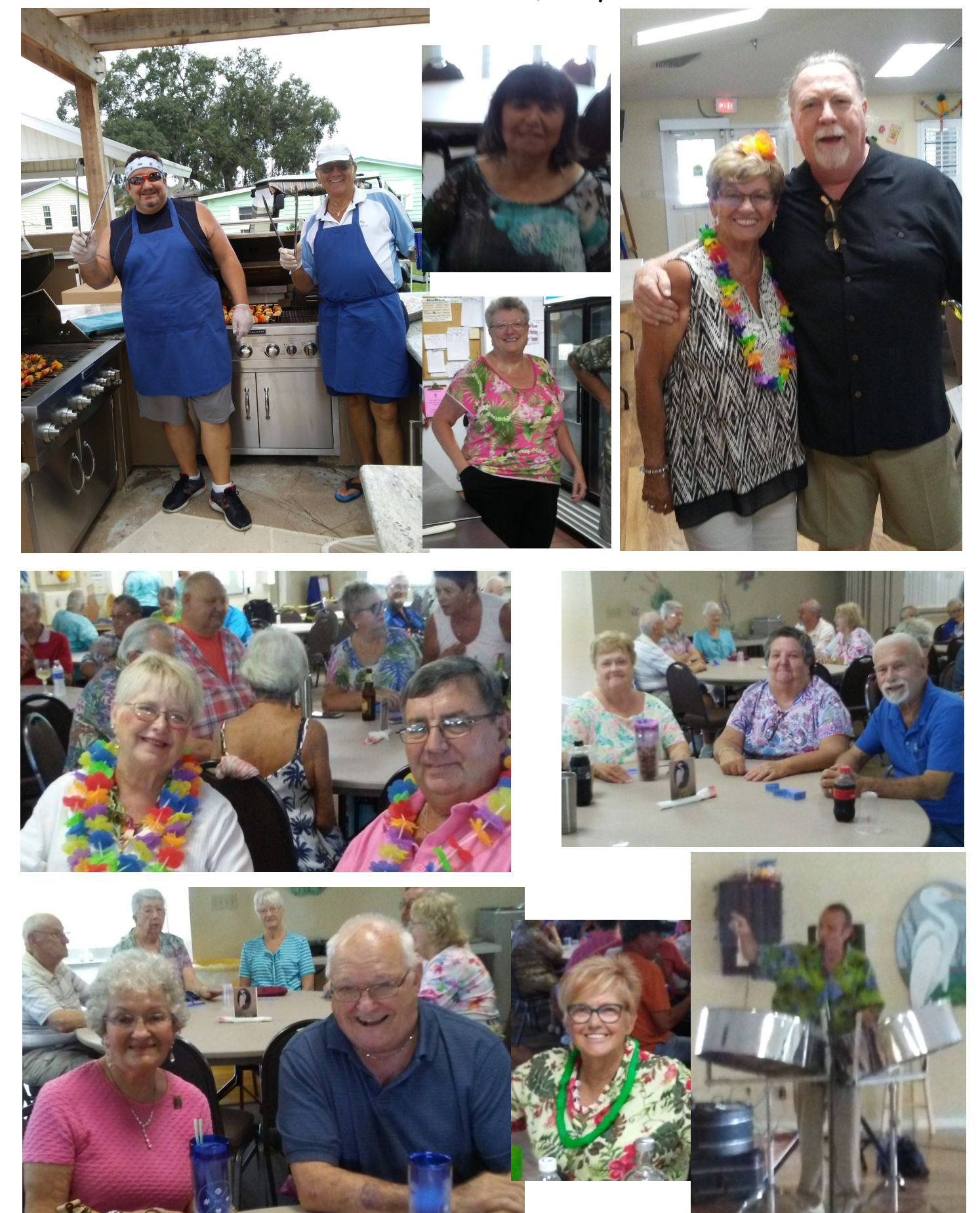
The Caribbean Dinner was a huge success. Rain (again) caused the meal to be served indoors but with about 150 in attendance, everyone had a wonderful time.