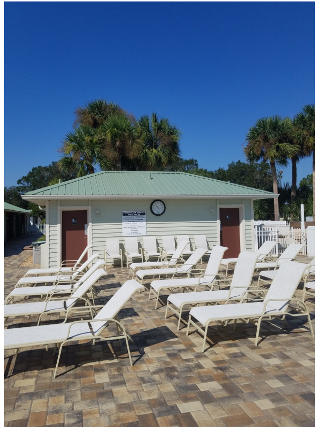
Both pools are completely resurfaced and up and running, the bathrooms have been renovated, the tiles have been coated and there is even a brand new volleyball net.