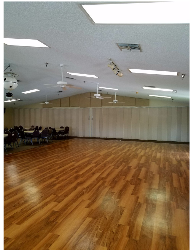
The partition in the club house will allow more groups to use the facility.