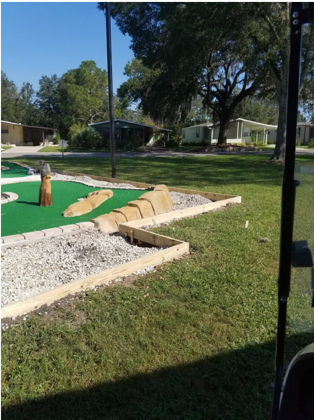
Staff is working on the miniature golf course as we go to publication. They are installing wood borders and adding more white rock.